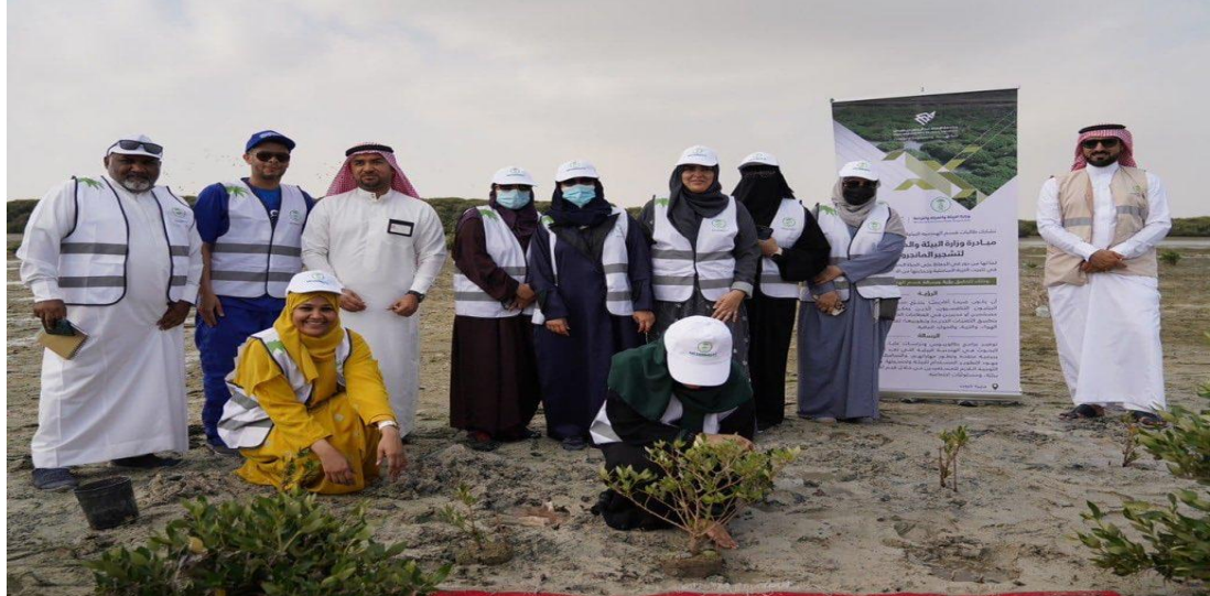
Let's Make Green campaign by IAU

Participation of female students of the Environmental Engineering Department of College of Engineering, Imam Abdulrahman Bin Faisal University, in the "Let's Make Green campaign" launched by the National Center for Vegetation Cover Development and Combating Desertification by planting 6,000 mangrove seedlings on the shores of the Arabian Gulf in Qatif Governorate.