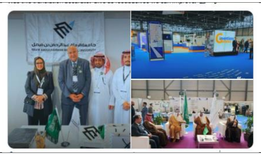
IAU Participation in Geneva International Exhibition

The #ImamAbdulrahman_Bin_Faisal_University delegation participants in the (49) Geneva International Exhibition of Inventions with five inventions, which will be held during the period 17-21 / April / 2024 AD. With the participation of: