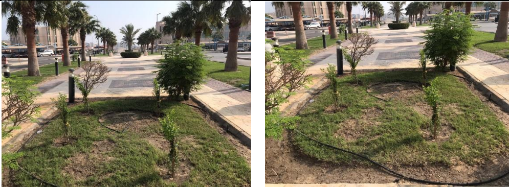
Example of Green Building Implementation – efforts in IAU, The cultivation of Nano Plants