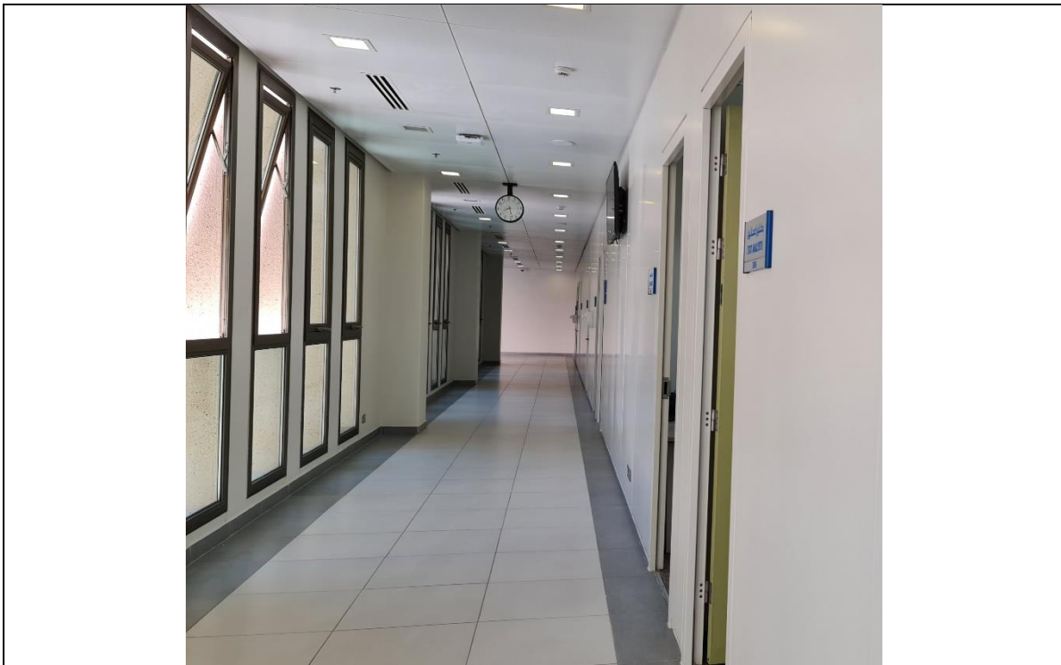
Natural Ventilation in the class room and office corridors