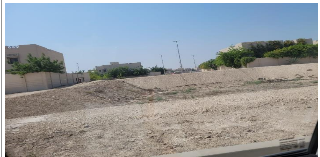
Water Collection and Storage plant