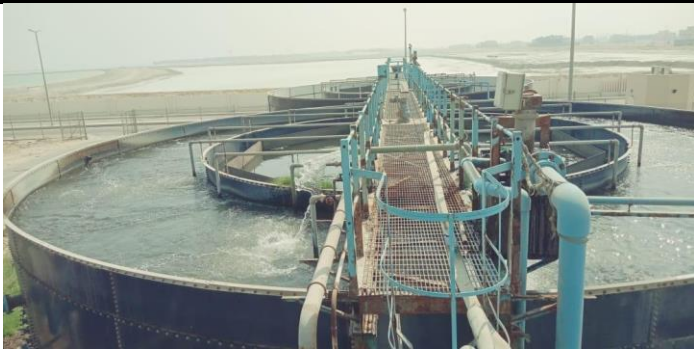
On campus biological water treatment plant at IAU