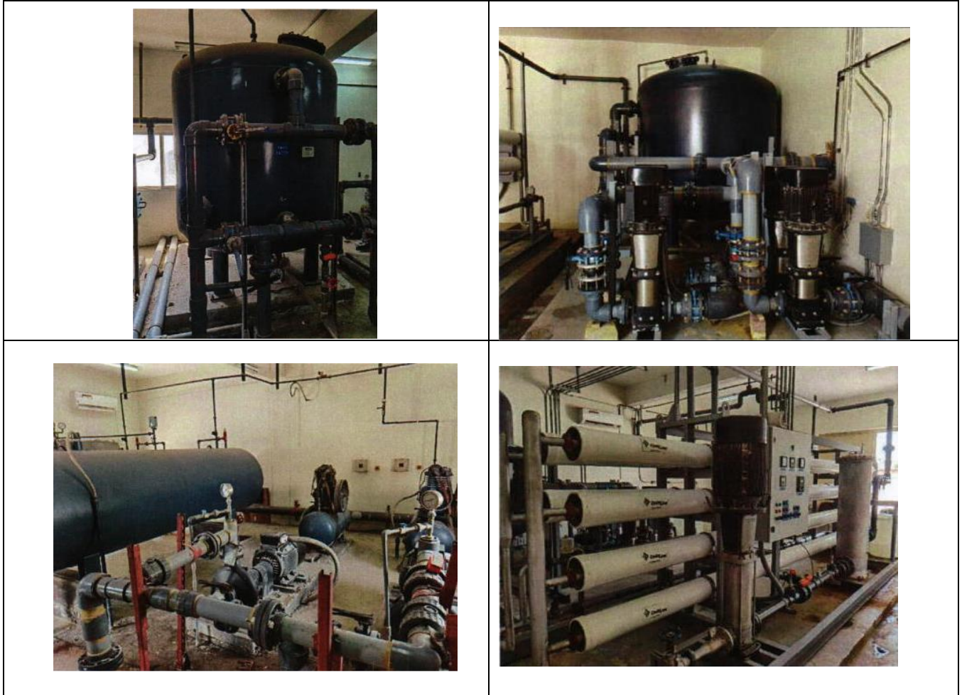
Water treatment plant at IAU